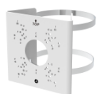
DCN-CBK627D Pole Mount