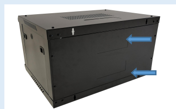
Cable entrance on rear panel