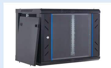
Removable side panels (Side lock optional)