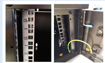
Zinc plated mounting profile with U mark (Ground wire optional)